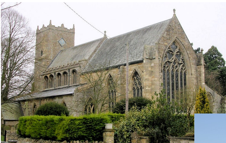
Above: St Peter's, Navenby