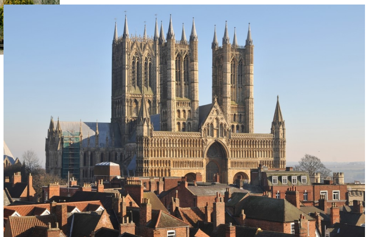
Right: Lincoln Cathedral