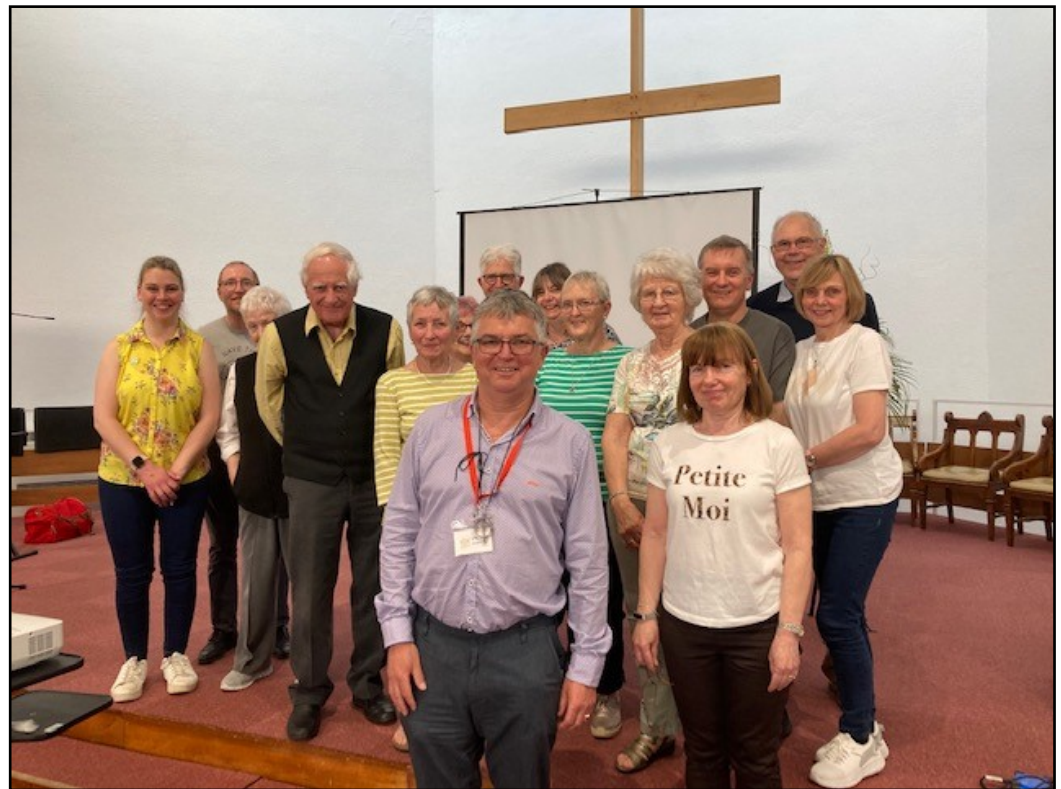
Below: The 10th Anniversary of Film Club (page 8)