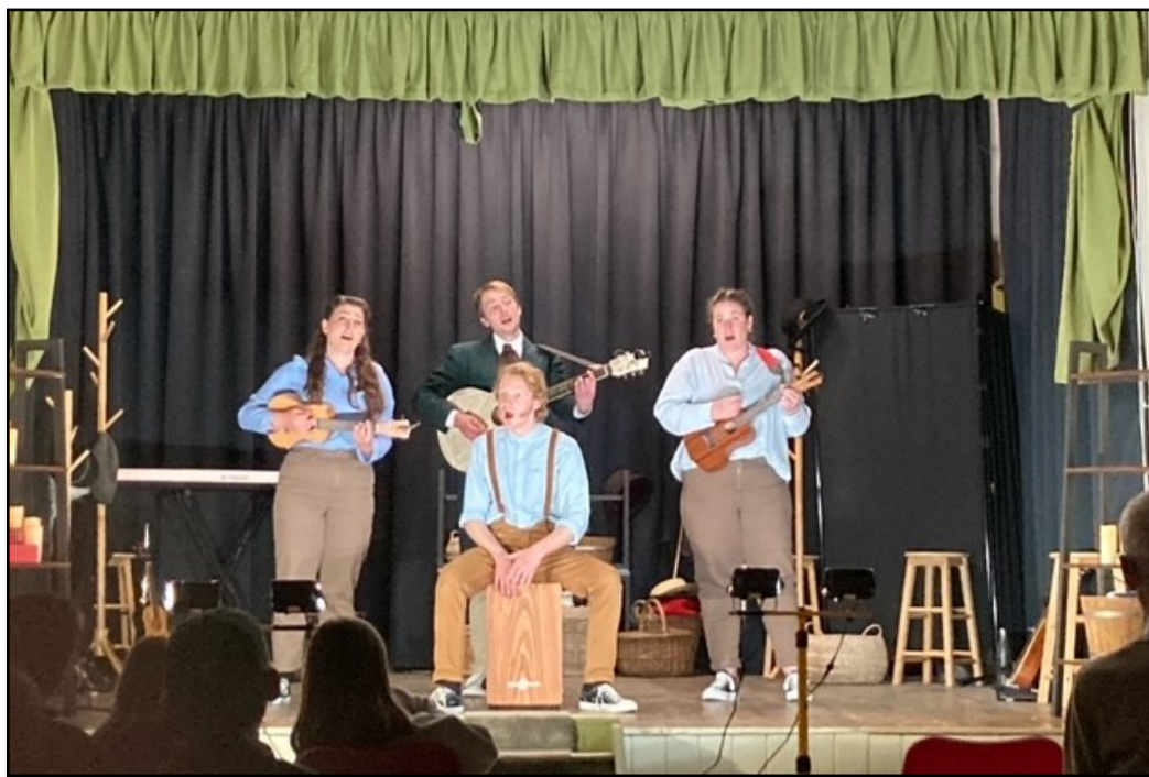
Left: The Pantaloons performance of Great Expectations.